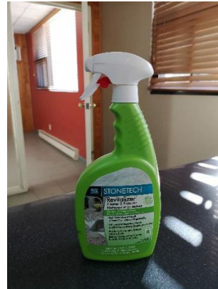
Stontech Revitalizer (cleaner & sealer reinforcement)