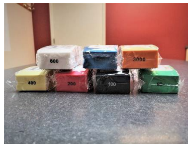
handheld diamond polishing pads (50-3000 grits)