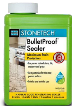
Stonetech Bulletproof sealer