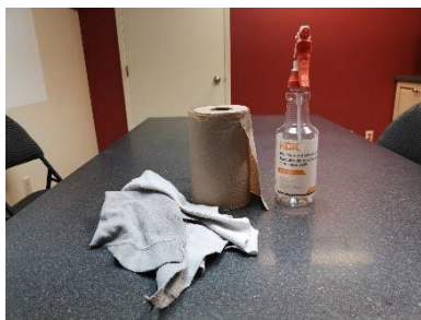
Spray bottle with water; paper towel or lint-free rags